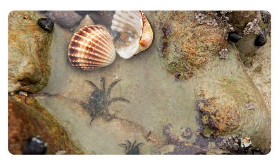
Rock pools are shallow pools of seawater on the rocky part of the seashore. Some only appear at low tide. They are habitats for many animals, such as starfish and crabs.