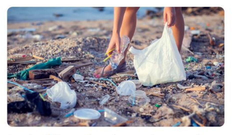
Leaving litter on beaches can harm and even kill the animals that live in the sea or on the seashore.