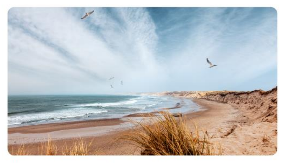
The seashore is the land along the sea or ocean. A beach is an area of sandy, pebbly or rocky land that is usually by the sea.

Read these interesting facts about the beach with a parent, carer or teacher.