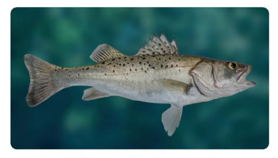
Fish use gills to breathe. They use their tails to swim and have fins to keep them upright.