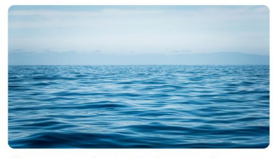
The ocean is a body of salt water that covers over two thirds of the surface of the Earth. The largest ocean is the Pacific Ocean.