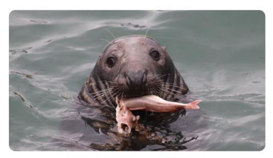
Carnivores eat other animals. Herbivores eat plants. Omnivores eat plants and other animals.