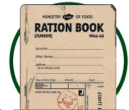
A ration book

Supply ships were targeted by German bombers and it was necessary to conserve as much food as possible.